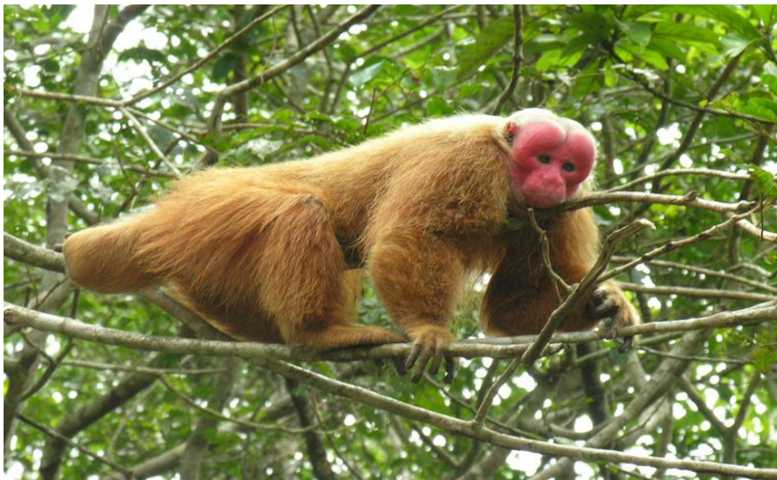
(Public domain photos)