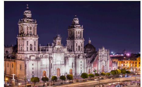
Walk the historic district and dine on authentic dishes in the heart of Mexico City.